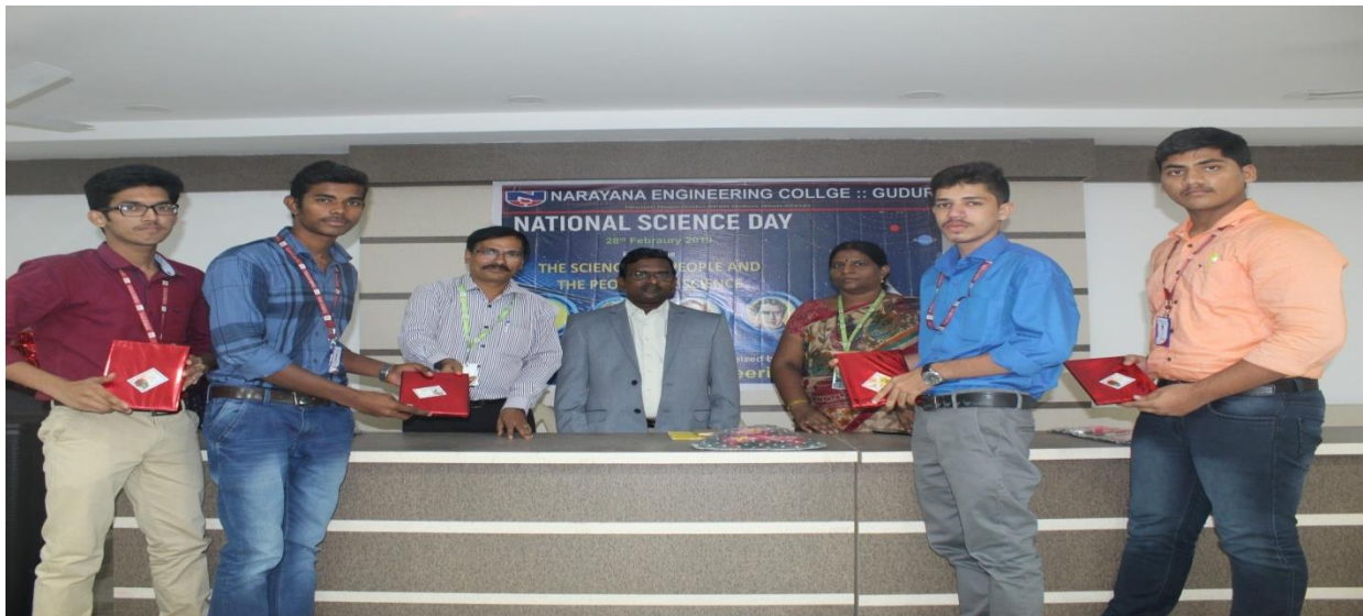
Prize distribution for winners and runners