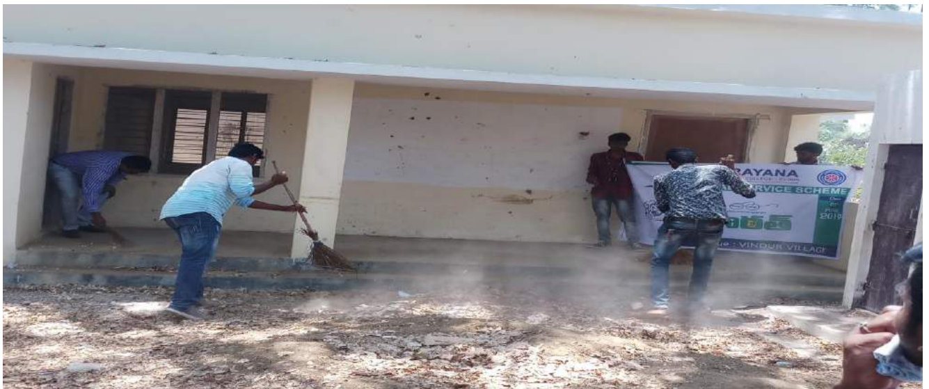
Students are cleaning school Campus