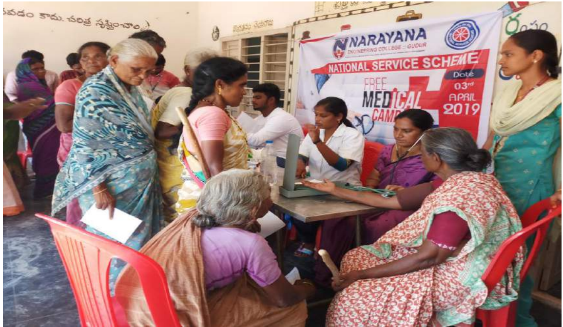
Doctor testing the patient