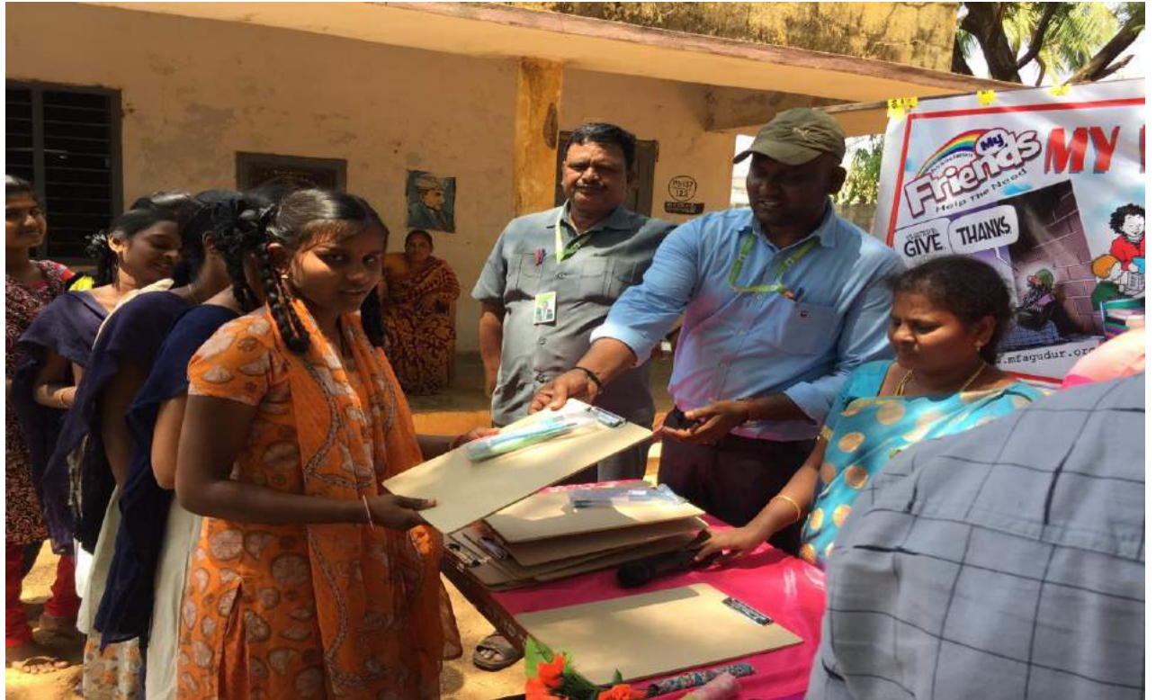
Distributing Examination Kits to the X th Class Students at ZP High School, Syadapuram