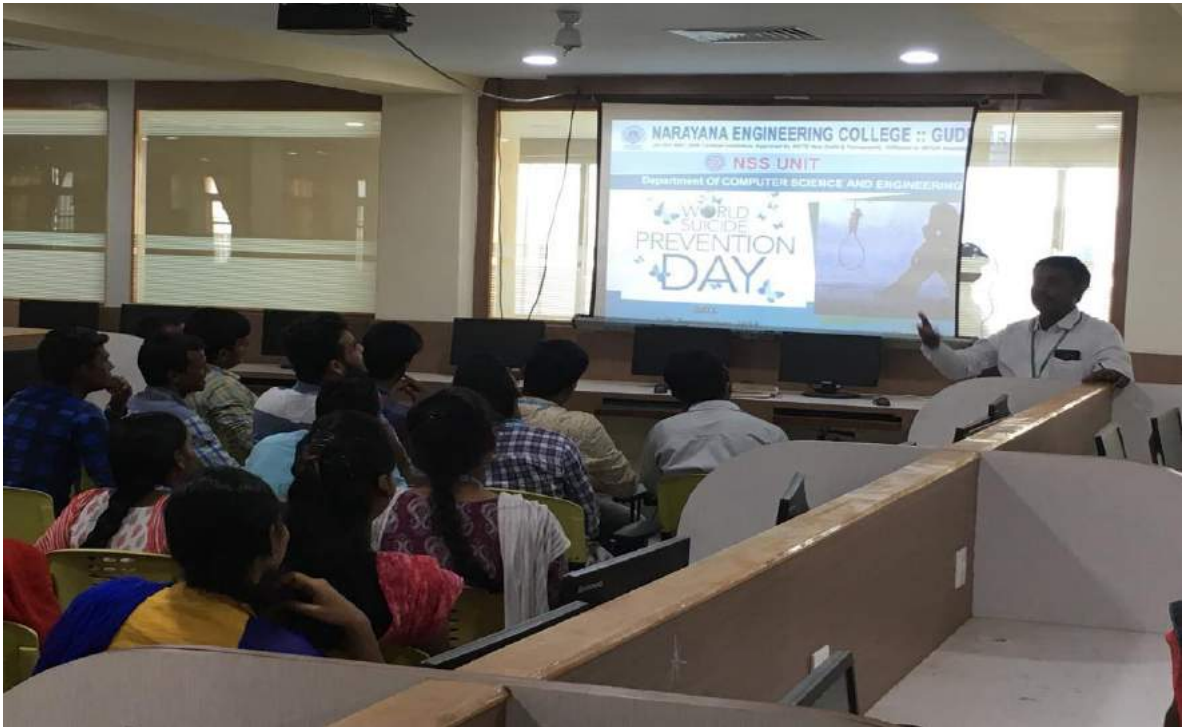
NSS Programme Officer Addressing the Gathering