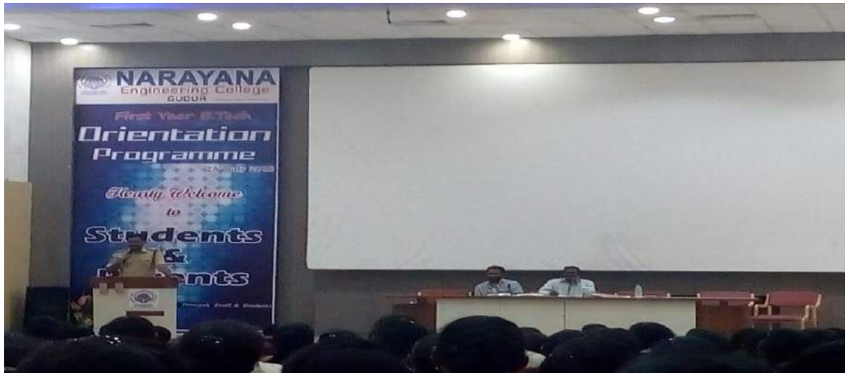
Chief Guest Addressing the gathering