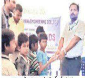
విద్యాసామగ్రి పంపిణీ చేస్తున్న నారాయణ కళాశాల విద్యార్థులు

విద్యకు పేదరికం అడ్డుకాదని నారాయణ కళాశాలలో ఎంబీఏ ద్వితీయ సంవత్సరం చదువుతున్న విద్యార్థులు అన్నారు. మంగళవారం సాంఘిక దానియల్ చిల్డ్రన్ హోమ్ లోని విద్యార్థులకు విద్యాసామగ్రి, పేస్టులు, సబ్బులు తదితరాలు పంపిణీ చేశారు. ఈ సందర్భంగా వారు మాట్లాడుతూ