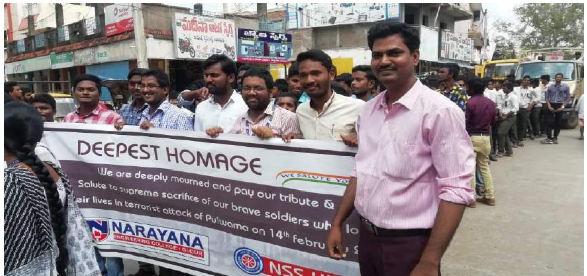
Students are Participating in Rally