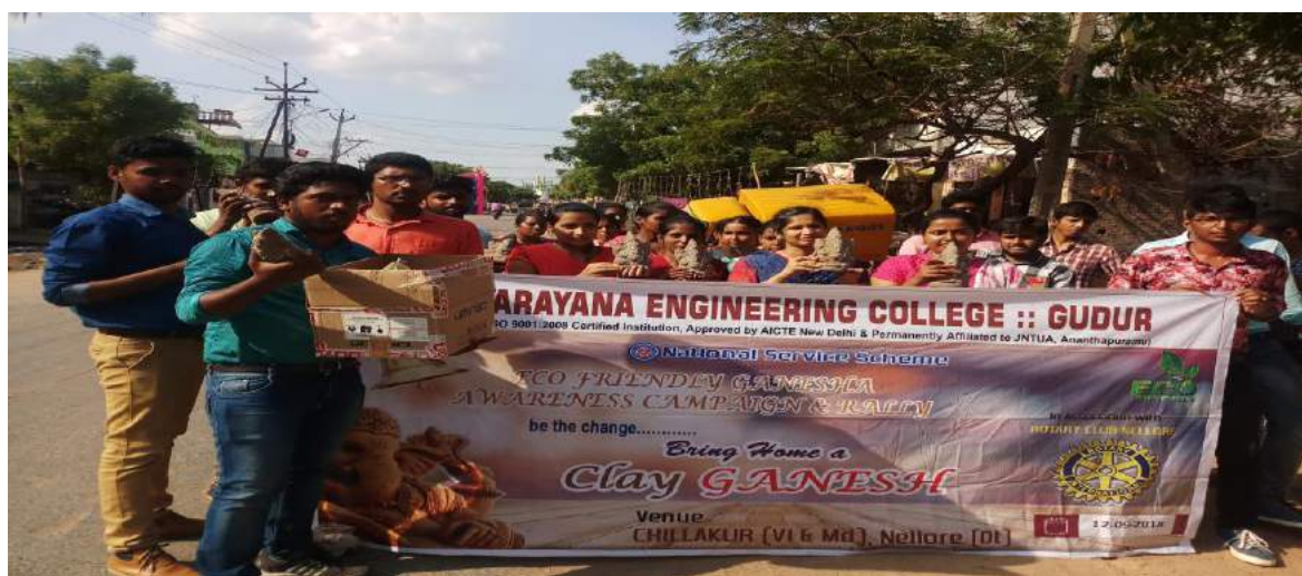
Students at the Rally