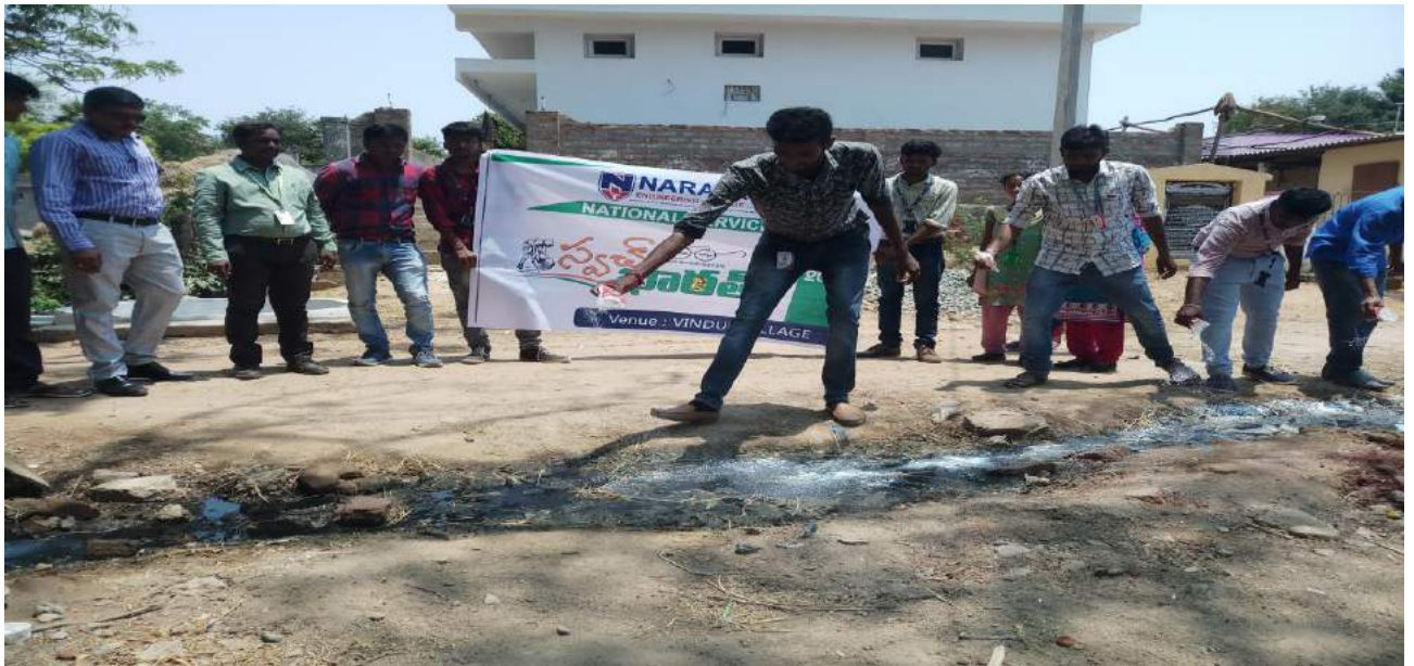
Students are powdered bleaching over the drainages