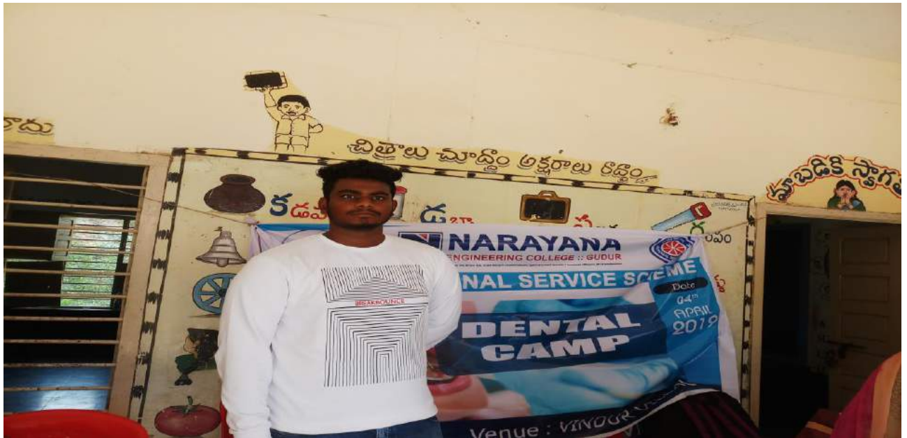
Doctor Testing the Students