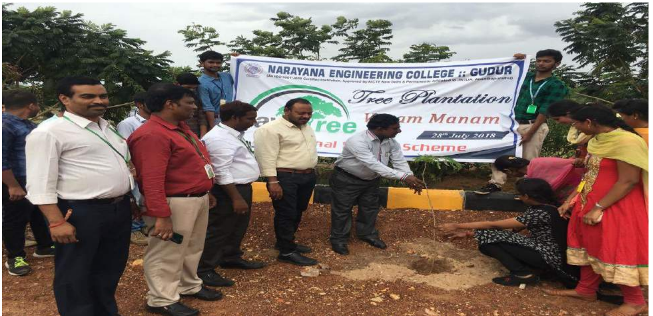
Principal, HoD's, NSS Programme Officer Inaugurating Plantation Drive at College Campus