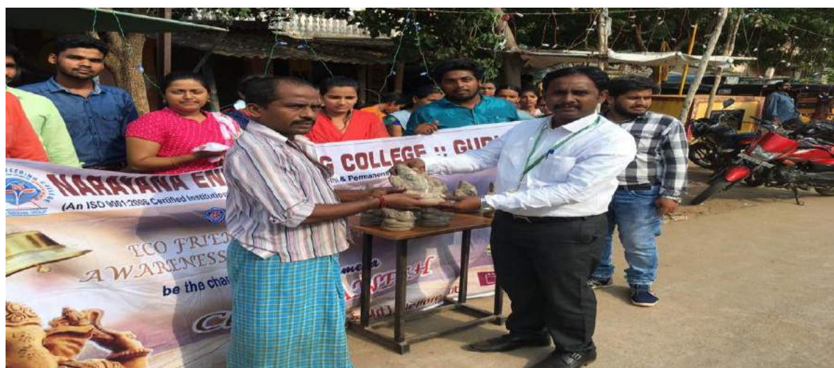
NSS Programme Officer distributing Clay Ganesh Idols