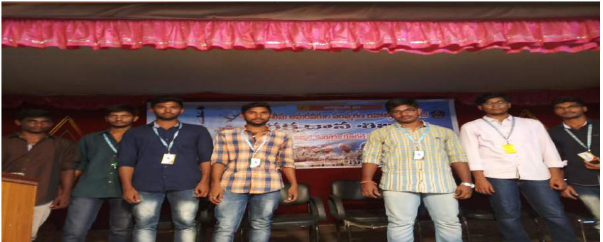
Students are participating in Blood Donation Camp