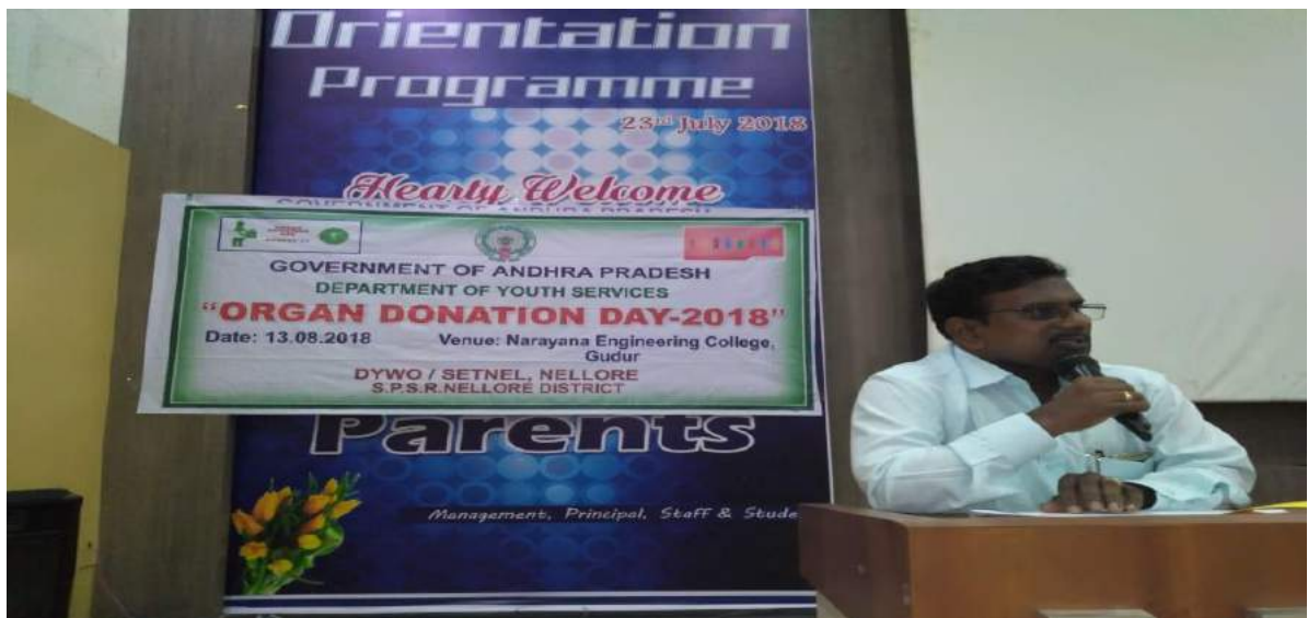
Principal Sir Addressing the gathering