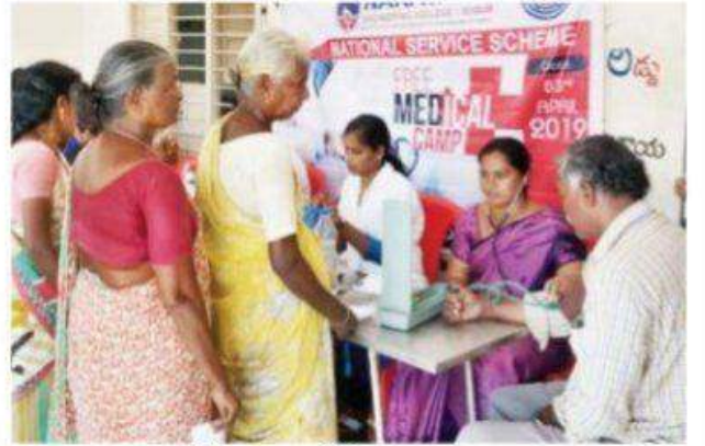
రోగులను పరీక్షిస్తున్న వైద్యులు